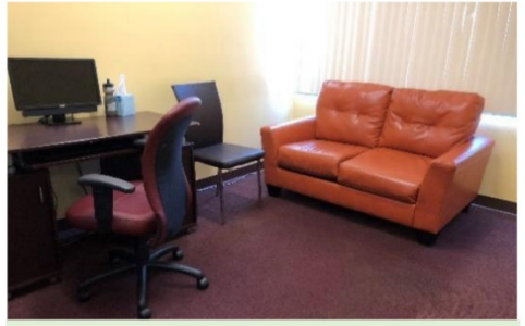
Therapy Room 9