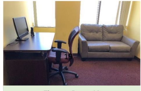
Therapy Room 10