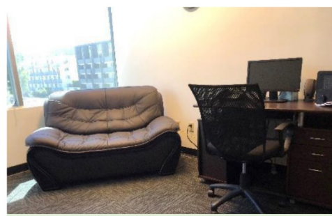
Therapy Room 1