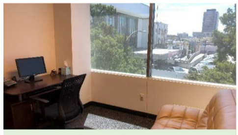
Therapy Room 3