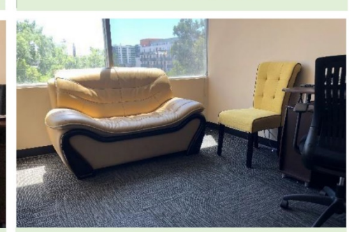
Therapy Room 2